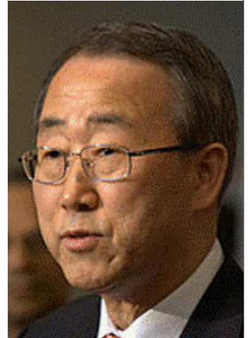
United Nations Secretary-General Ban Ki-moon will address the Conference

From 2 to 3 September, these Partners together with stakeholders from all over the globe are holding a conference called "From Vision to Reality: A New and Holistic Approach to Fighting Corruption", during which the Academy will be launched. And I am delighted to tell you that the United Nations Secretary-General Ban Ki-moon will address the IACA Inaugural Conference on 2 September, in addition to many Government Ministers and high-levels experts who will participate in this prestigious event.