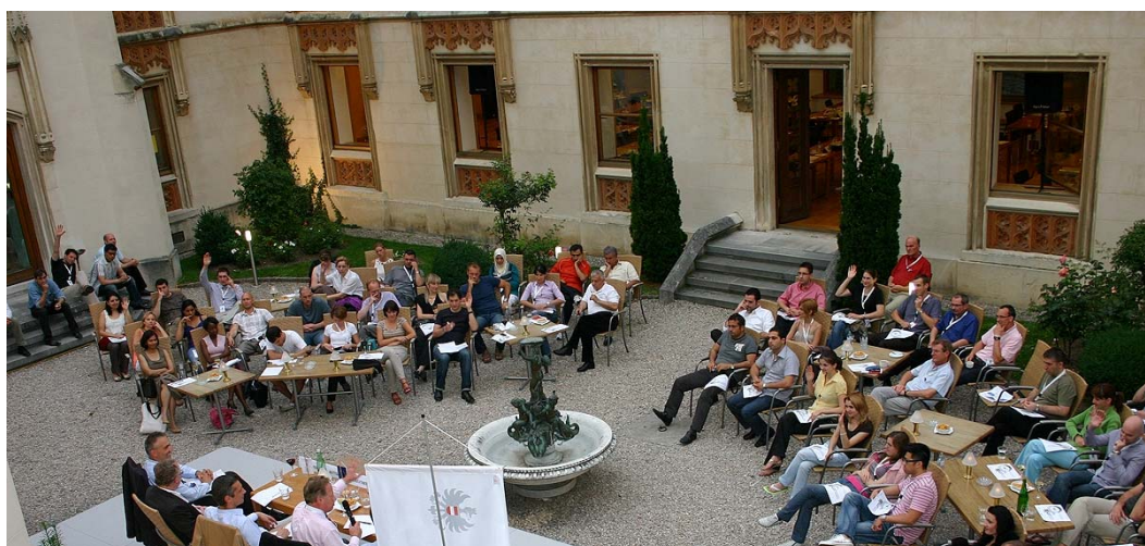
Students in discussion

The Basel Institute conducts research and offers policy advice and capacity building support in public, global and corporate governance/compliance.