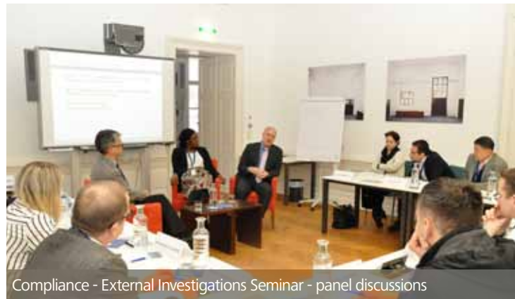
Compliance - External Investigations Seminar - panel discussions

In early March IACA delivered a two-day seminar for business professionals on The External Investigator's Perspective in Regulatory Compliance Investigations .