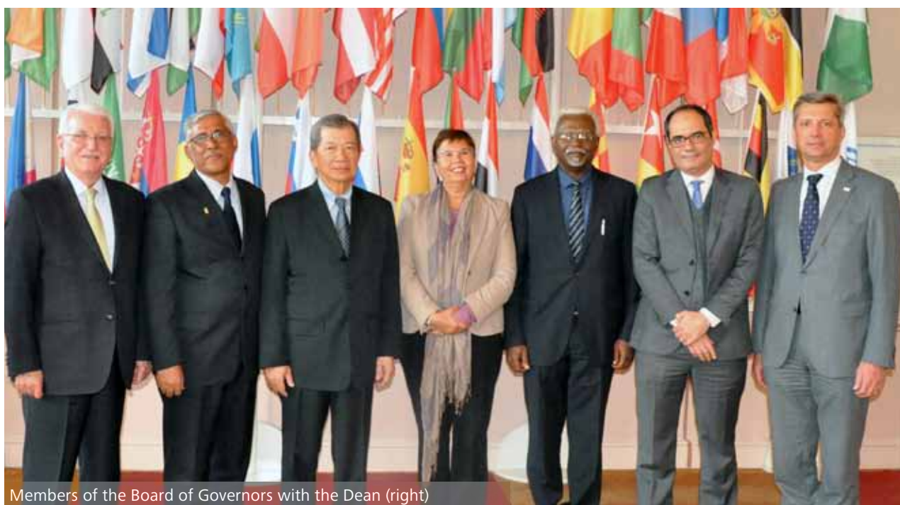
Members of the Board of Governors with the Dean (right)

The IACA Board of Governors held its first meeting of the year on 7 March to discuss the upcoming independent external audit of the organization as well as preparations for the seventh session of the Assembly of Parties later